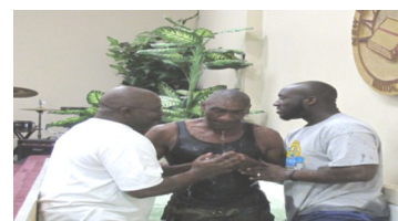
Welcome new Baptized Believer